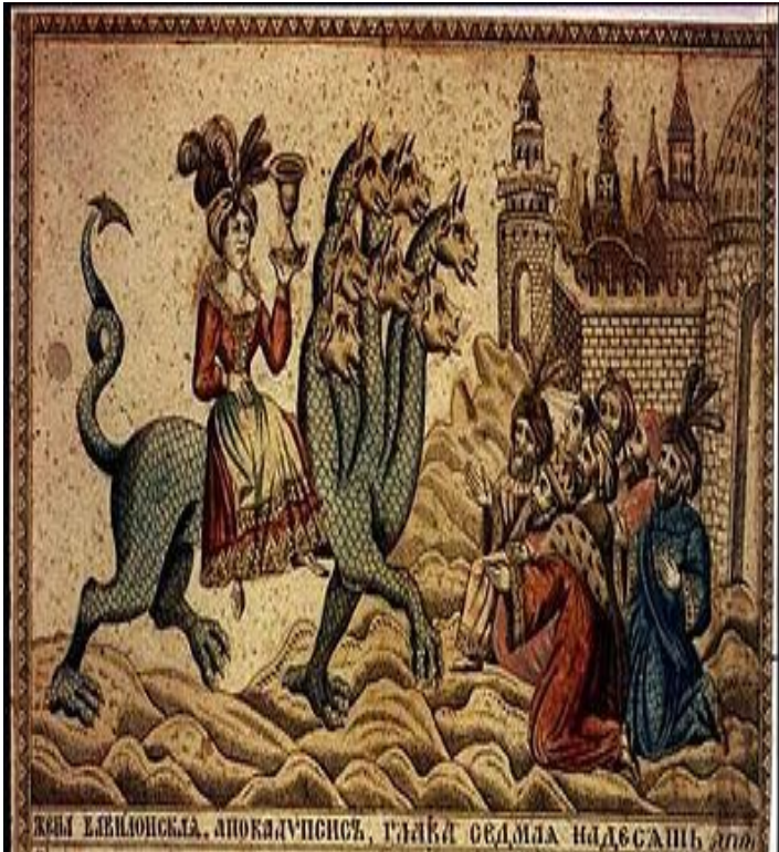
MYSTERY, BABYLON THE GREAT

Funny. They all said President G. W. Bush was dumb, you know, not as smart as former Vice President Gore. Bush is dumb like a fox and Gore is just plain stupid, promoting the big global warming lie. However, the legacy that has been planted by Bush will play a tremendous roll in fulfilling Revelation 18 and Zech 5, in the Bible.