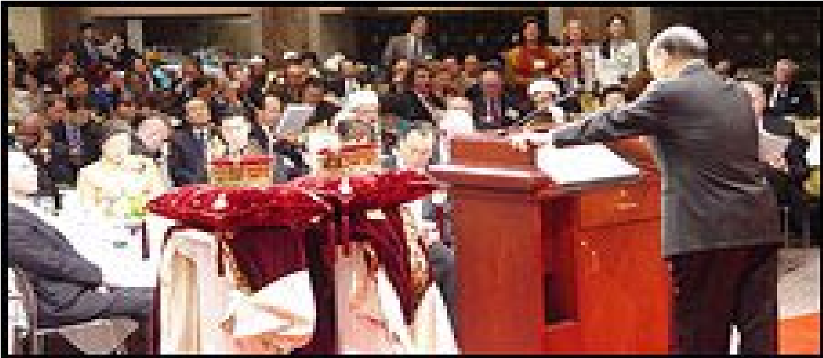
Crowned Reverend Sun Myung Moon the New Messiah

On Mar. 23 in the Dirksen Senate Office Building U.S. Congressman Danny Davis of Illinois crowned Reverend Sun Myung Moon the new Messiah. The huge event was held in the Dirksen Senate Office Building -- a US government building -- on Capitol Hill. Not only were there Congressional Co-Chairs of the event (Congressmen Danny Davis, Curt Weldon, Roscoe Bartlett, Sanford Bishop and Chris Cannon), others played roles that evening. US Senator Lindsey Graham, NRCC Chair Tom Davis and