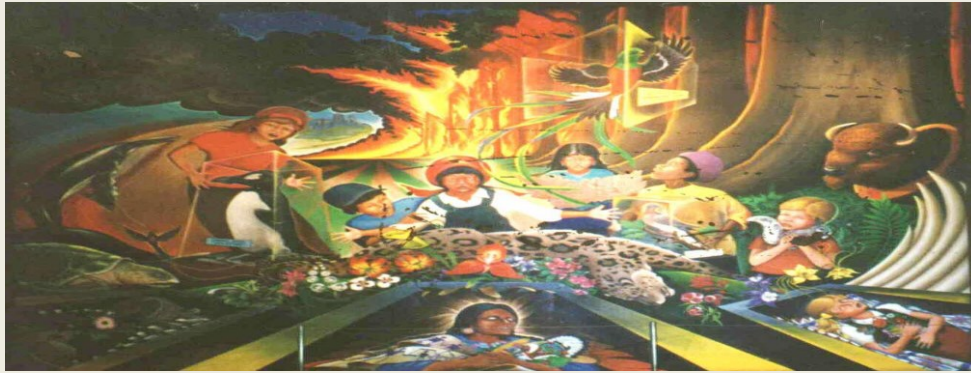
PEACE AND SAFTY

After the darkness and terrier of the destruction, it brings light; the surviving children of the New Age forth mourning the death of their parents. See the woman in the coffin.