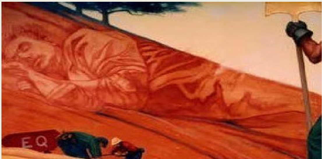
SLEEPING GIANT MURAL WORKERS DIGGING

(The above illustration is NOT A PART OF THE SERIES OF MURALS ) [In occult teachings, alchemical transformation can happen on numerous levels: a material level, where crude metals are transmuted to pure gold, but also on a spiritual and philosophical level, where the profane man becomes a "regenerated man". In secret-society lore, the entire world is considered to be the subject of alchemical transformation; it is said to be an imperfect plane needing to be "transmuted into gold" in order to mirror the heavens, in accordance with the hermetic axiom "As Above, So Below". Is a New World Order the "Great Work" of the occult elite? 45