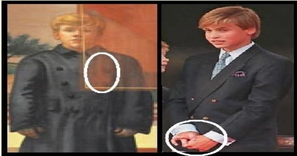
Prince William's boyhood AP photograph?

A Masonic engraving depicting stairs leading from the Masonic floor to the "outside" 30