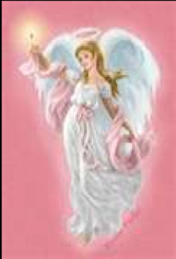
AN ANGEL CALLED EMMA