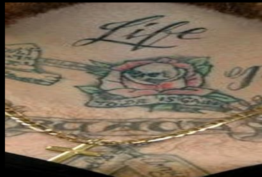
TATTOO ONI ANGEL IN ROSE